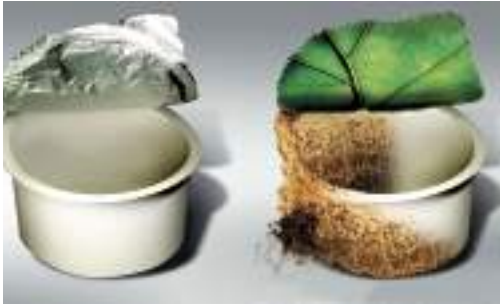
Industrial compostable products